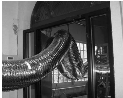
Air Conditioning was piped in from large units in the Burial Grounds, (above) while artificial snow covered Oliver Avenue at the back entrance