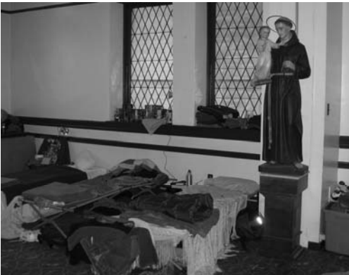
The Dining Room becomes a dormitory (above) with the hallway serving to house supplies and filming equipment (below)